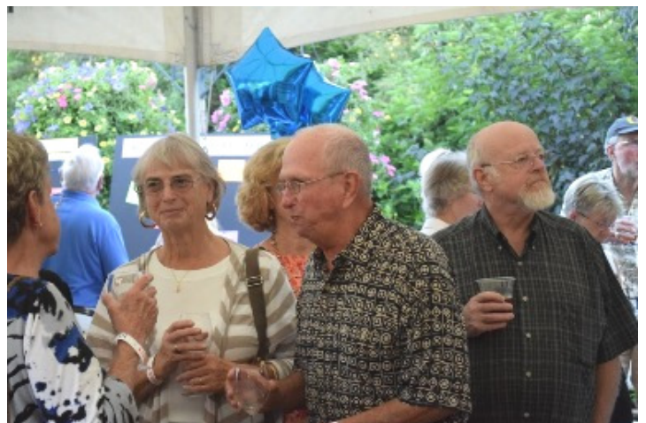
Photo above: Folks enjoying the auction festivities.