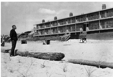
Photo above: Tom McCall looks at the former Surfsand Hotel.

Tom McCall's beach bill in the 1970s illustrated the power of people who wanted to protect this major natural resource for Oregon. Tom Olsen, a Portland videographer instructor and producer of documentaries, will screen parts of his film "The Politics of Sand".